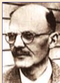
Hans Wilhelm Geiger