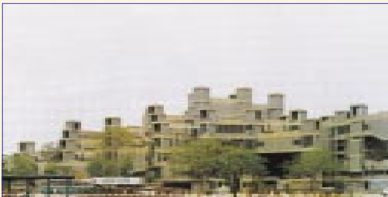
A view of the Main Building of National Science Centre, New Delhi

The Centre presently has on display four permanent galleries on different scientific themes. The first gallery, which depicts the rich scientific heritage of India, is titled “ Indian Heritage ”. The most popular gallery of the Centre is “ Fun Science ”, which has around 100 hands-on interactive exhibits explaining scientific principles in interesting way. The “ Information Revolution ” gallery shows the relation between society and advancement in information technology. The gallery also has quite a few interesting artefacts. This gallery has been awarded the prestigious Dibner Award