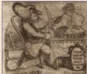
Cholera Pie Caricature by Cruikshank suggesting that doctors thrive on cholera

The scientific world of Germany felt jubilant and proud over Koch's fresh success. The German Emperor bestowed on him the highest emblem or honour, the Order of the Crown .