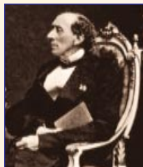
Hans Christian Andersen

Bohr could never master the language he spoke or wrote. In fact in his school, Bohr's worst subject had been Danish composition. It is said that even for writing a postcard Bohr would first prepare a draft. Bohr was not at all comfortable in writing. He dictated entire doctoral thesis to his mother. While Bohr's father thought that a PhD student should write his own thesis but his mother firmly believed the task was hopeless. Most of Bohr's later work and correspondence were dictated to his wife and his secretaries or co-workers. He took long time to write a paper.