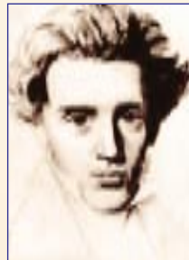
Soren Aabye Kierkegaard