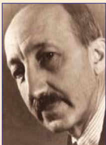
George Charles von Hevesy

For any young scientist it was a great honour, an offer coming from a great scientist like Rutherford. Moreover, financially it was more lucrative to work in an English university than in Denmark. But Bohr, being a great patriot, did not accept