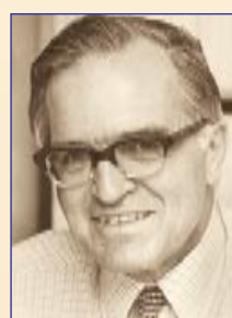
Aage Niels Bohr

Denmark was occupied by the Germans. Bohr, who had a Jewish mother, felt it necessary to escape from the occupied Denmark and eventually made his way to Los Alamos in the USA where he served as a consultant on the atomic bomb project. Bohr's son Aage Niels Bohr also worked here as a Junior Scientific Officer. By mere presence of Bohr, the project, 'which looked so macabre' seemed to be hopeful. To quote Weiskopf : "In Los Alamos, we were working on something which is perhaps the most questionable, the most problematic thing a scientist can be faced with. At that time physics, our beloved science, was pushed into the most cruel part of reality and we had to live it through. We were, most of us at least, young and somewhat inexperienced in human affairs, I would say. But suddenly in the midst of it, Bohr appeared in his Alamos.