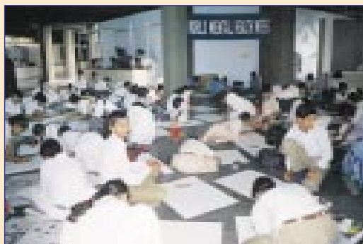
World Mental Health Week

It is open for school students of Delhi and also for neighbouring suburbs and is conducted throughout