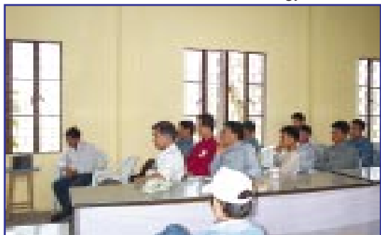
People listening to first broadcast on WorldSpace digital radio

Under this new initiative, Vigyan Prasar has made available digital radio sets