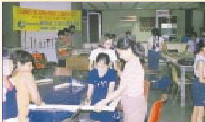
Summer Vacation Hobby Camps-2002

the year. Attractive prizes are awarded to the winners.