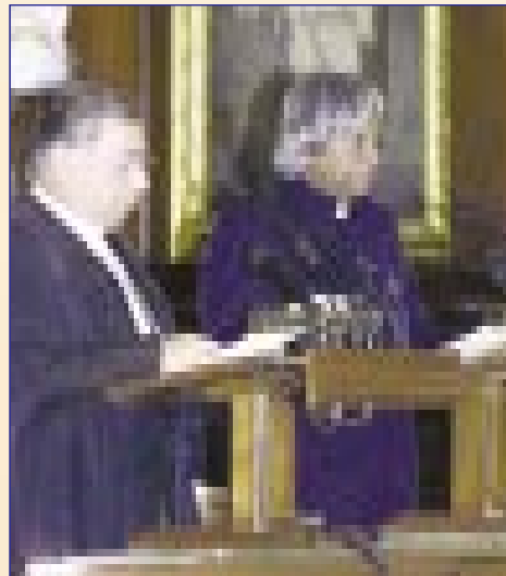
The Chief Justice of India Shri B.N. Kirpal administering the oath of office of the President of India to Dr. A.P.J. Abdul Kalam at a Swearing-in-ceremony in the Central Hall of Parliament in New Delhi on July 25, 2002

Before he became President of the country, Dr. Kalam had divided his career in four phases. In the first phase (1963-82) he worked with ISRO. At ISRO he served in various capacities. After initiating Fibre Reinforced Plastics (FRP) activities and spending some time with the aerodynamics