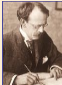
Joseph John Thomson