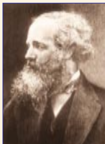
James Clerk Maxwell

Today the far reaching implications of these papers in the growth of physics are well-known. In these papers Bohr not only gave a highly useful model of the atom but he also showed that quantum mechanics was a fundamental part of how nature worked. It may be noted that Newtonian physics or the classical physics which explained the working of nature on the larger scale failed to explain the behaviours of the subatomic particles. Bohr's ideas were radical. Most of the scientists were not ready to accept them. As pointed out by Otto Robert Frisch (1904-79), "That picture was so unorthodox at the time that a number of physicists...had sworn to give up physics if that nonsense (Bohr's atomic model) was true". Even scientists like Thomson, Lord Rayleigh and Einstein were not much enthused. In 1914 Rutherford said : "while it is too early to say whether the theories of Bohr are valid, his contributions...are of great importance and interest." And