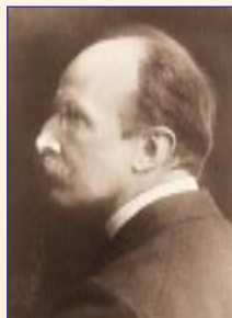
Max Karl Ludwig Planck

the offer. Thus instead of opting for working in an established laboratory and as a colleague of Rutherford he decided to stay in Denmark to establish his proposed institute. Building the institute in war-ravaged economy was not an easy task. But Bohr's resourcefulness somehow made it possible. The Institute of Theoretical Physics was formally inaugurated in September 1921. Bohr became its first director, a post he held till his death. Bohr started living on the upper floor of the Institute. Bohr made the Institute the ultimate place for theoretical physics in the world. To quote Spangenburg and Moser : "During the 1920s and 1930s, the Institute for Theoretical Physics in Copenhagen, headed by Bohr commanded an influence over the world of scientific thought equaled only by Aristotle's Lyceum in Athens. Theoretical physicists went there from all over the world, during a time often called the heroic age of atomic physics."